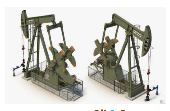
Oil & Gas